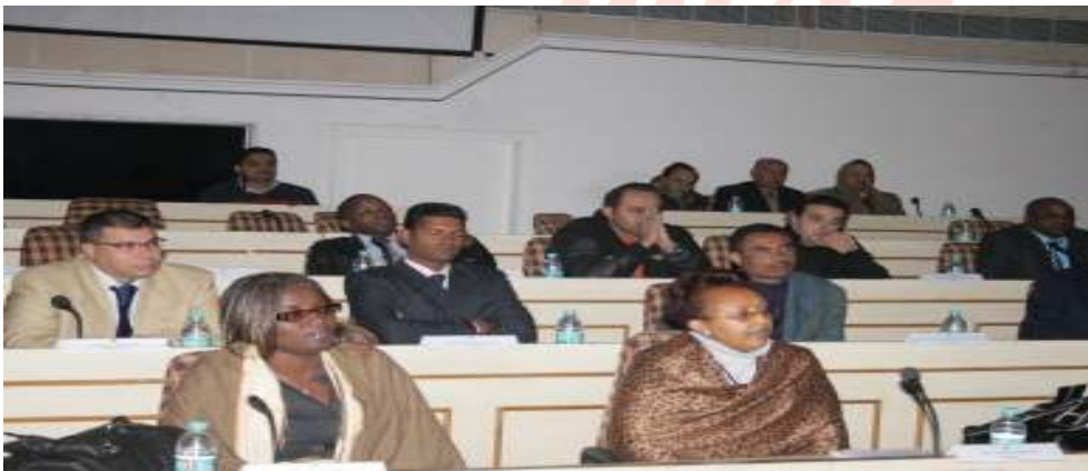
Trainees from South Africa