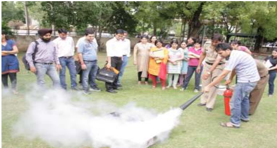
HCS Trainees experiencing the Mock Drill on Fire Management

General Administration, Administrative and Financial Skills, Revenue, Law and Social Issues, etc.