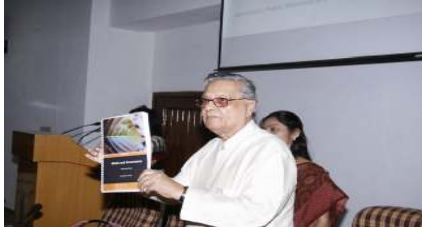
Justice P.V. Reddy releasing the book on Media and Governance on the occasion of Seminar on Media and Governance on September 16, 2011